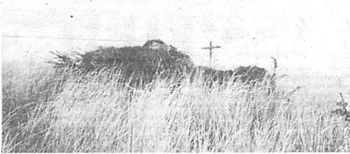
Dune destruction by people.